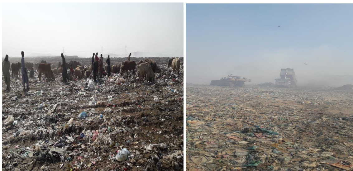
Gond Pass & Jam Chakro, Landfill sites

During performance audit of Sindh Solid Waste Management Board, it was observed that management of the board failed to establish Garbage Transfer Stations and landfill sites throughout Sindh, except for the above mentioned two landfill sites. Even these above-mentioned landfill sites were established by KMC.