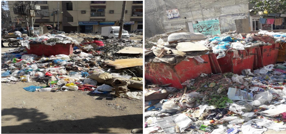
Baloch Colony, District East

Audit was of the view that due to lack of data regarding waste generation and collection, performance of the Board could not be ascertained.