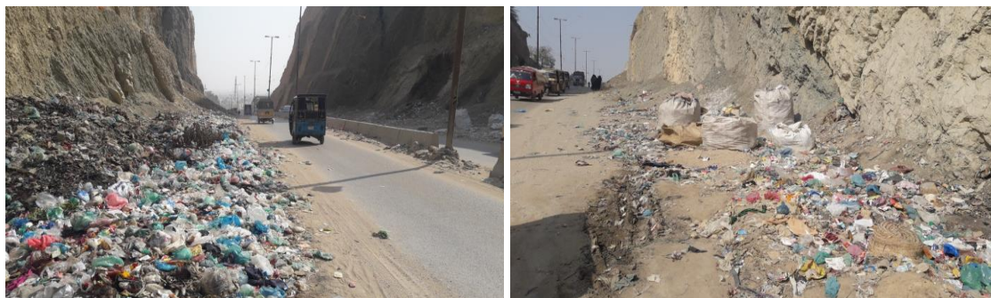
Qasba Colony (District West)

During performance audit of Sindh Solid Waste Management Board, it was observed that the management of the board did not have data regarding total daily waste generation and disposal of the province. In absence of data, the Board's operations and activities regarding collection, disposal, outsourcing/contract agreements and imposition of any taxes were based on estimates and guess works. Board relied on borrowed data from other agencies like KMC and DMCs.